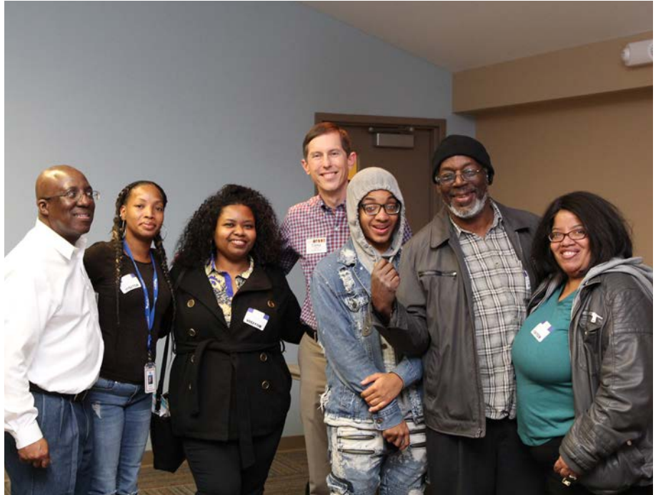
Working together to overcome life's challenges!